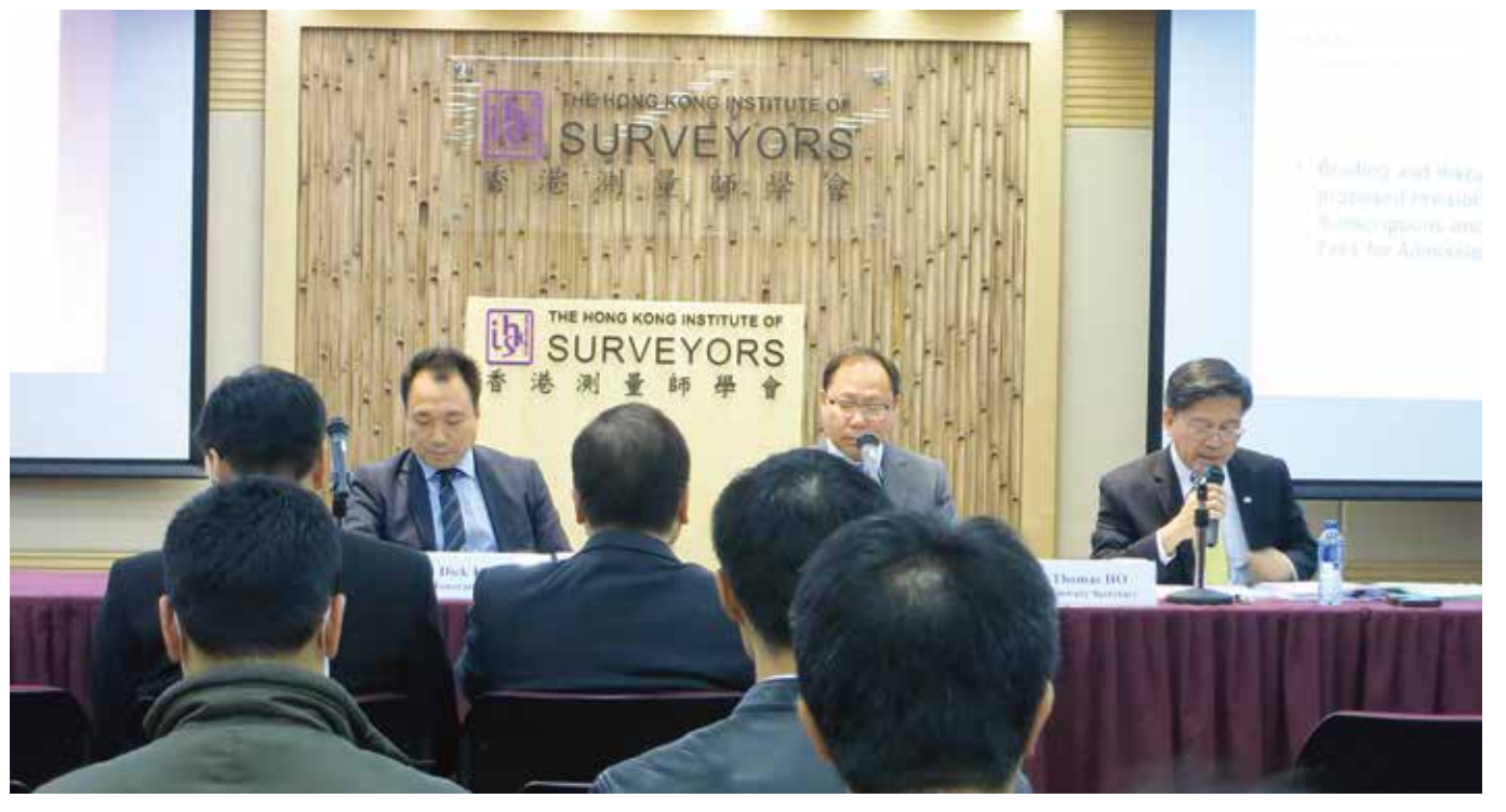
The HKIS President chaired the EGM on 24 Feb 2014