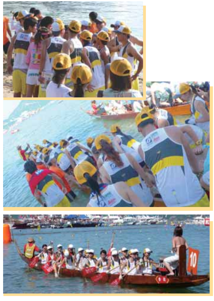
Not a very long list but does show the enthusiasm and how much the dragon boat means to the YSG and of course the Institute.