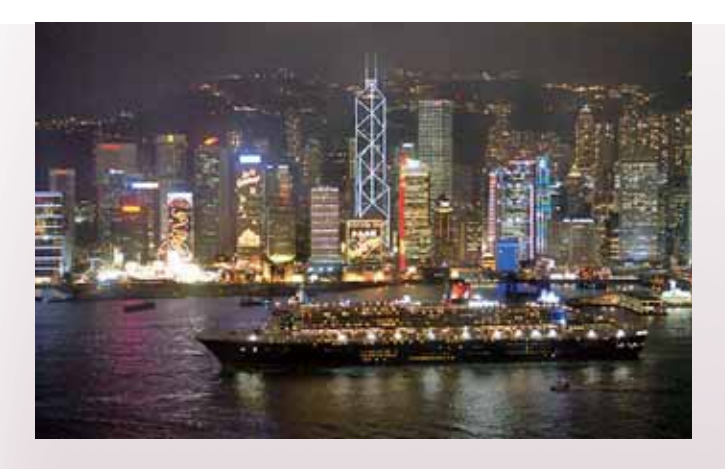
Development of a new cruise terminal at Kai Tak

In October 2006, Government announced its plan to proceed with the development of a New Cruise Terminal at the southern end of the former runway in Kai Tak. Government intends to invite an open tender in Q4/2007 immediately after the completion of the necessary town planning procedures under the Town Planning Ordinance. The Tourism Commission has recently developed some proposed development parameters for the Project and invited the HKIS to an exchange session on 9 May held at the Central Government Offices.