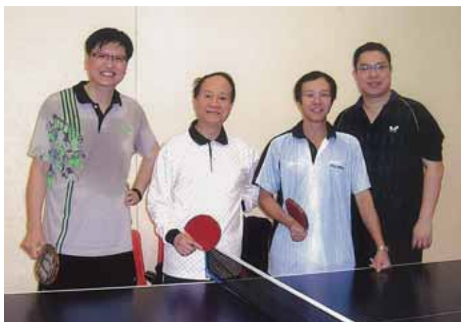
Table-tennis Team: 18 December 2008, Wanchai Harbour Road Sports Centre, Wanchai.

Regular practices are being conducted by the 2 team captains of table tennis and tennis. The recent practices were held or will be held on:-