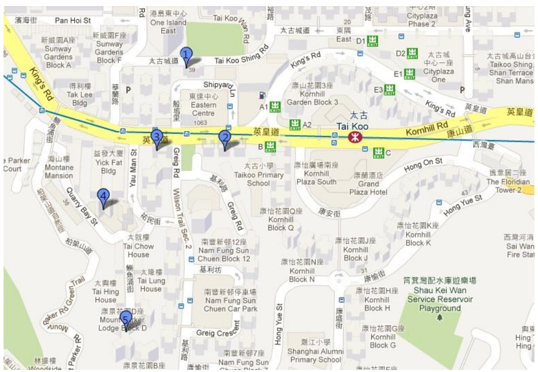
Figure 2: Location of selected residential estates (Tai Koo Shing/Quarry Bay)

Three districts: Tai Koo Shing/Quarry Bay (Hong Kong Island), Cheung Sha Wan (Kowloon), and Shatin (the New Territories) are chosen for investigation (for the location of property estates selected, see Figures 2-4). The sample includes all transactions of residential flats within 16 residential buildings/estates between the third quarter of 2011 and the second quarter of 2012, during which 312 transactions had been recorded.