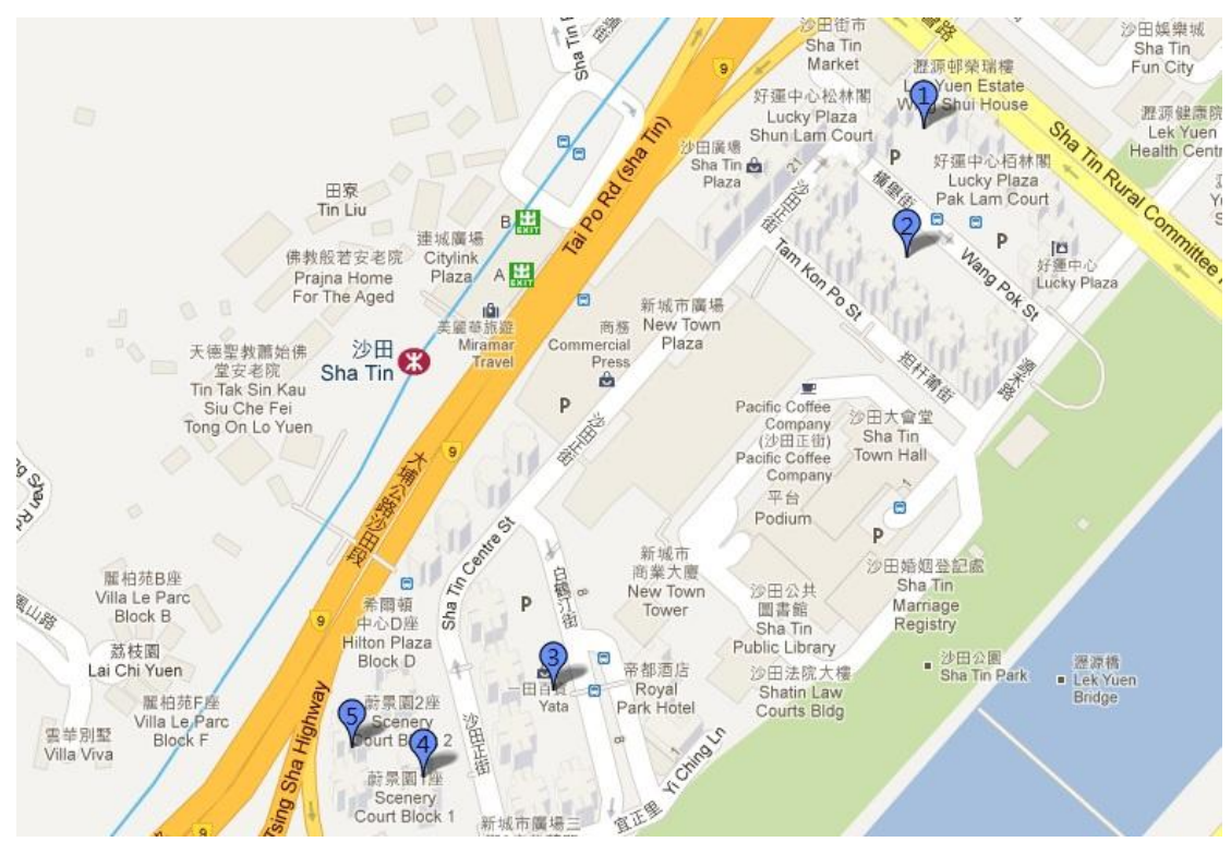
Figure 4: Location of selected residential estates (Shatin)